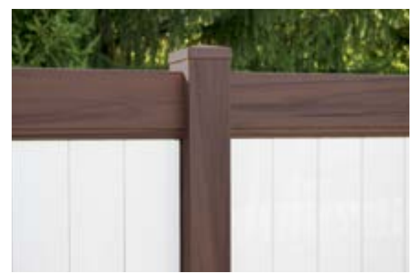
Signature fence carries a 20-year limited warranty.