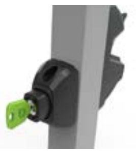
Double Sided Keystone "X" Latch