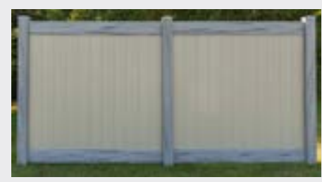
Storm & Clay