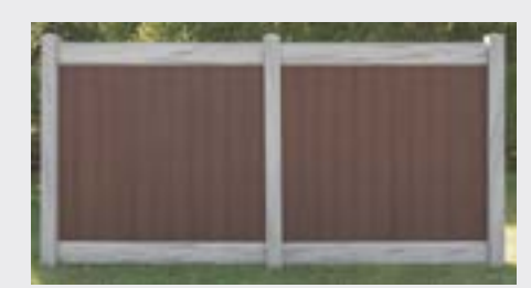
Storm & Cayenne