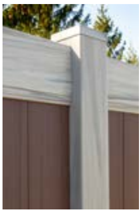
ASA\ cap\ is\ uniquely\ formulated\ for\ darker\ colors.