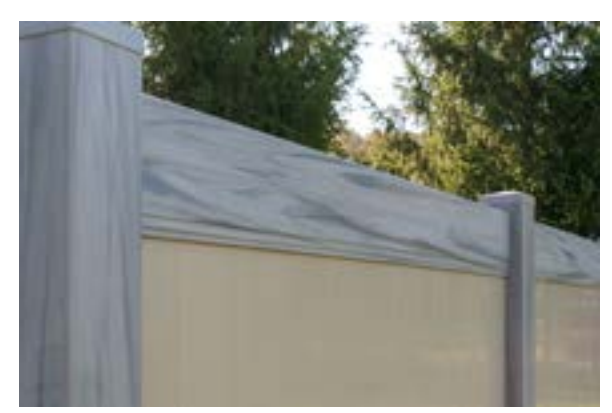
\label{lem:constraint} Variegated\ extrusion\ simulates\ a\ non-repeating\ woodgrain\ pattern